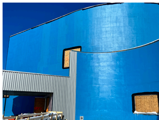
The beginning of the metal cladding that will cover the building.