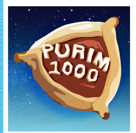
Purim 1000 Community Event Sunday, March 24 from 2-5 pm Jewish Community Campus $18 per family Register at PurimKC.org

Sunday, March 24 at 10:30 am Goldsmith Hall Join us for morning minyan and a family-friendly megillah reading.