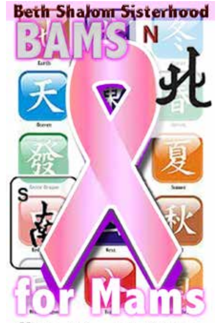
Nov. 13 - 11:00 am

Sisterhood is grateful for all the advertisers in our community and synagogue who helped make our calendar a success. The commitment of the Calendar Committee made it possible to produce a calendar filled with helpful information about all facets of our synagogue life. Please note that beginning on page 85 is a directory with phone numbers, addresses and emails of our congregants and Sisterhood members.