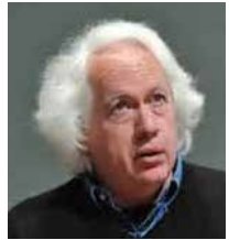
Guest speaker Leon Wieseltier

Leon Wieseltier, a noted American intellectual, philosopher and Literary Editor of The New Republic , an American magazine of commentary on politics and the arts, will give a compelling talk. He is a leading Jewish thinker and a recent recipient of the renowned Dan David Prize.