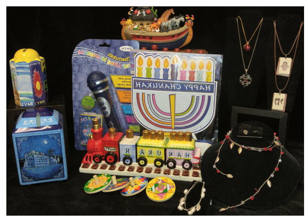
HUGE HANUKKAH SALE

50% off select items + inventory clearance 50-70% off select items (items will never get lower)