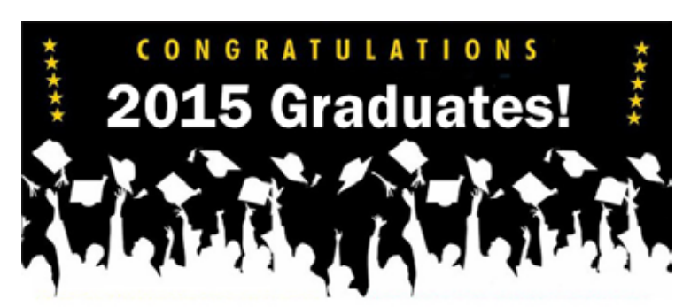
Beth Shalom wishes a hearty Mazal Tov to all our 2015 graduates.