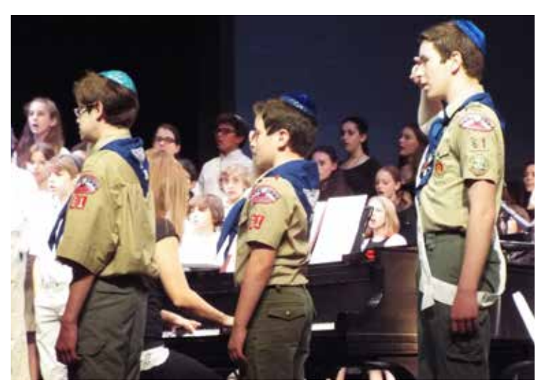
Members of Troop 61 participating in the Yom HaShoah Memorial Commemoration.