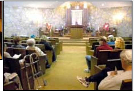
Sanctuary Service B'Yachad Tefillah 2000

Beth Shalom is committed to offering a variety of prayer experiences. For 20 years, the Library Minyan and Tefillah 2000 have provided members of our congregation with meaningful worship and study options. As we prepare to move into the Lamar campus, appropriate spaces will accommodate these important minyanim. See below.