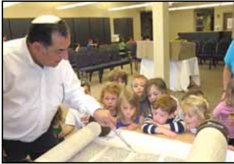
Library Service Daily Minyan Tot Shabbat