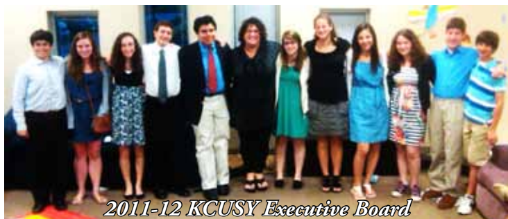
2011-12 KCUSY Executive Board