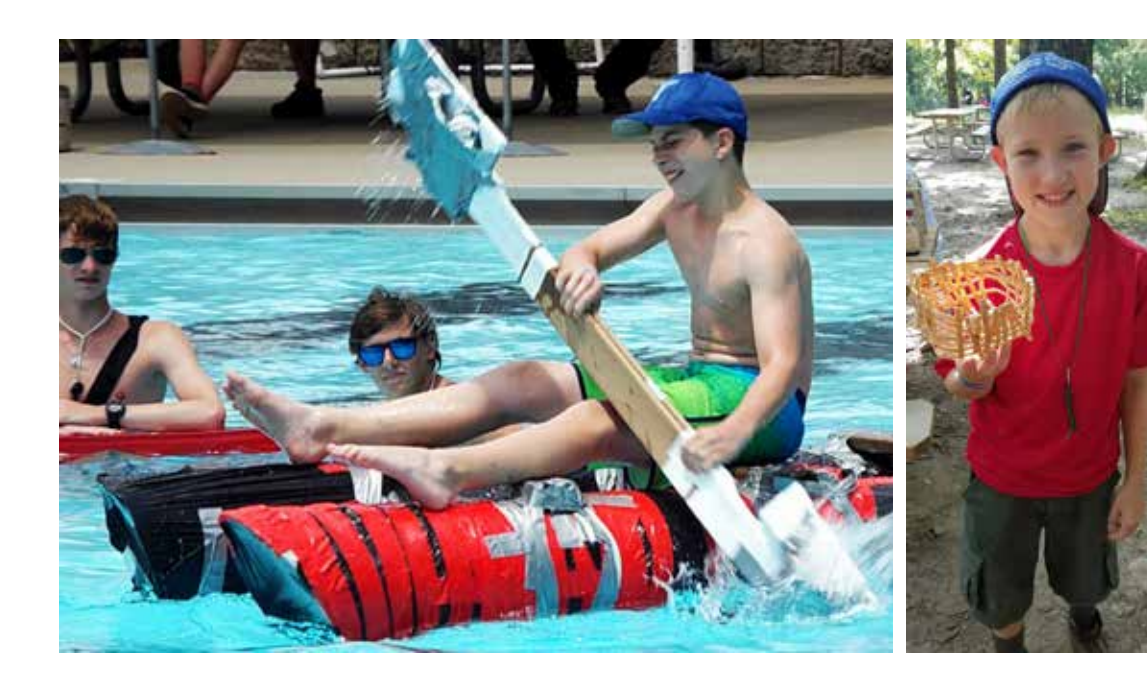
Troop 61 at Camp Sawmill in Bartle Scout Reservation