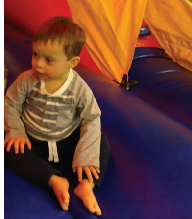
Bounce to the Moon