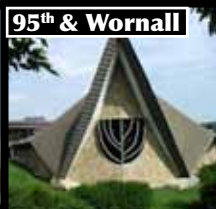
95 th & Wornall