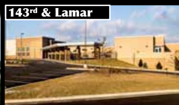
143 rd & Lamar