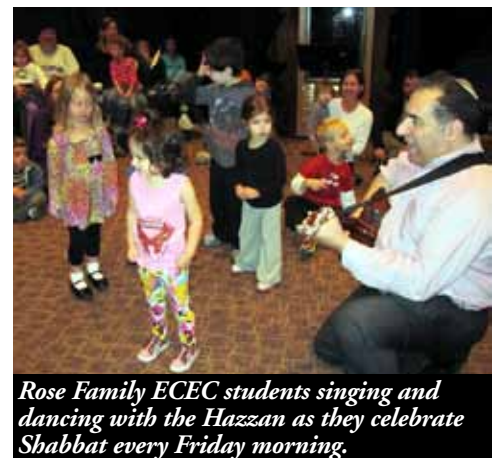
Rose Family ECEC students singing and dancing with the Hazzan as they celebrate Shabbat every Friday morning.

The event is being generously sponsored by Westport Flea Market, US Toy and Gottlieb, Flekier & Company. All proceeds benefit Congregation Beth Shalom.