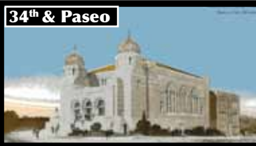
34 th & Paseo