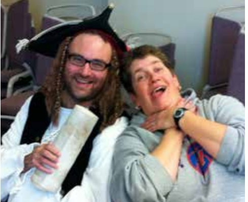
Purim as Capt. Jack Sparrow