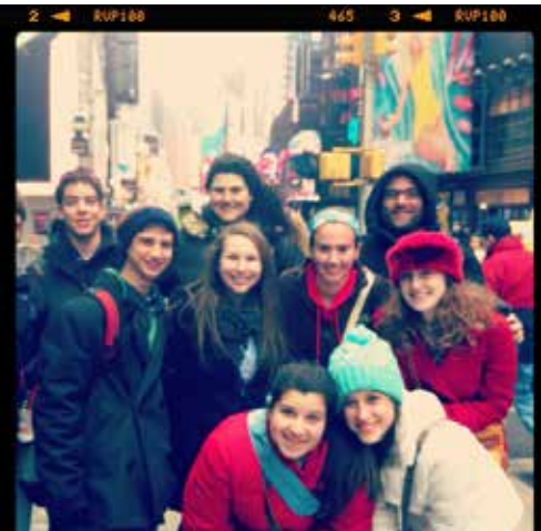
Confirmation Trip to NYC March 16-20