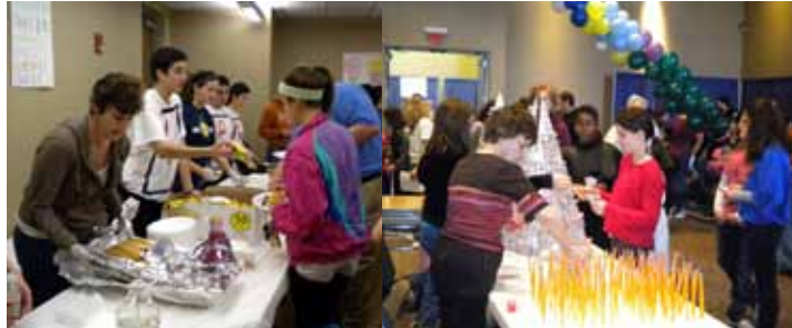
Food and games galore were had by all at the carnival!