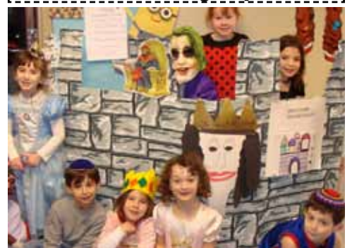
Kindergarten & 1 st grade students prepare for Purim