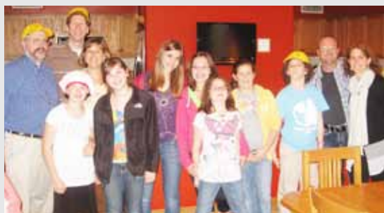
2010 Mitzvah Day Participants

Join us on Sunday, May 15 for our annual Mitzvah Day. The day will begin at noon with lunch at Lamar. Please bring a dairy sack lunch; drinks and dessert will be provided. After lunch, we will journey to Beth Shalom at 95 th and Wornall Road, Mt. Carmel Cemetery or the Mitzvah Garden.